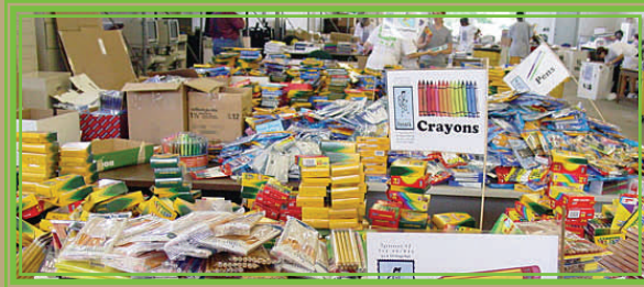
School Supply Drives