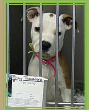
Animal Rescue Shelters