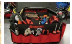
And More Tools