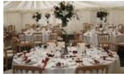
Receptions / Dinners