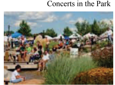
Concerts in the Park