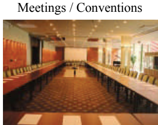
Meetings / Conventions